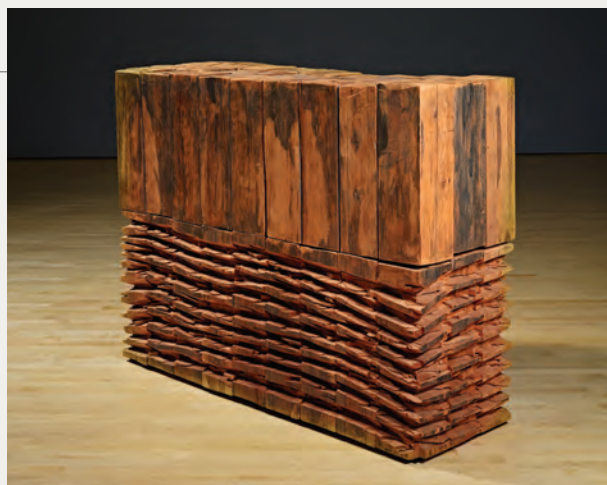
Ursula von Rydingsvard (U.S.A., b. 1942), Pink Companion , 1991. Cedar; graphite and resorcinol glue. Gift of the Halperin Family, 2015.75