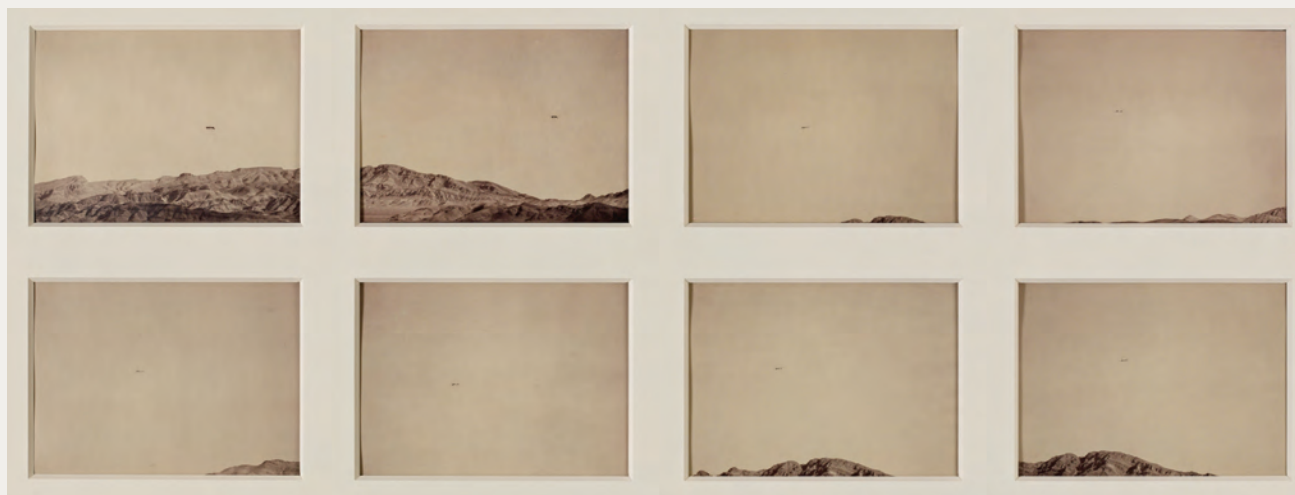
Trevor Paglen (U.S.A., b. 1974), Time Study (Predator; Indian Springs, NV) , 2010. Eight gold-toned albumen prints. Robert E. and Mary B. P. Gross Fund, 2016.7